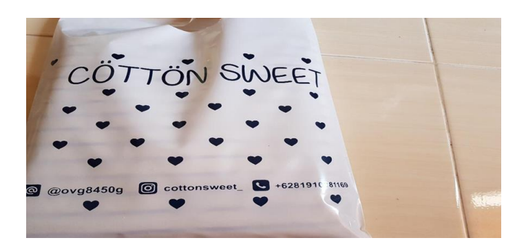
Figure 3. Packaging Hoodieku and Cotton sweet

In addition, there are also things that must be considered are packaging, neat and unique packaging will give a positive impression on customers, for example, cotton sweet packaging has a unique plastic wrap in products where the plastic has a cotton sweet logo and a heart logo that will be the main attraction. The packaging from my hoodieku where they use box-shaped cardboard to store their products to give the impression of an expensive product. You should also pay attention to this especially if the product being sold is glassware, the packaging must be taken seriously so that the product does not break when arriving at the buyer, one way is to use bubble wrap so that when it is shaken it does not directly collide with the jar to prevent the item is destroyed (Figure 3).