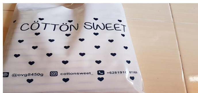
Figure 3. Packaging Hoodieku and Cotton sweet

In addition, there are also things that must be considered are packaging, neat and unique packaging will give a positive impression on customers, for example, cotton sweet packaging has a unique plastic wrap in products where the plastic has a cotton sweet logo and a heart logo that will be the main attraction. The packaging from my hoodieku where they use box-shaped cardboard to store their products to give the impression of an expensive product. You should also pay attention to this especially if the product being sold is glassware, the packaging must be taken seriously so that the product does not break when arriving at the buyer, one way is to use bubble wrap so that when it is shaken it does not directly collide with the jar to prevent the item is destroyed (Figure 3).